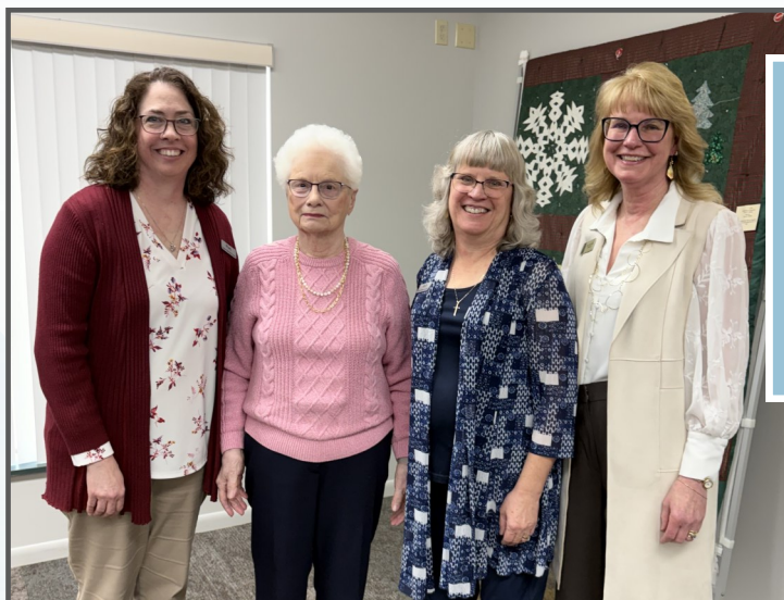
Pictured are 4 Rawson Library Directors (left to right):