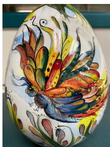
Art Class - Fantasy Painting

Also for Art View 2022, we are hosting a Tiny Art Challenge. Masterpieces 4" x 4" x 4" or smaller have been submitted and will be displayed in our showcase. Come